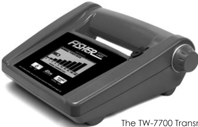
The TW-7700 Transmitter.

The Transmitter has two controls: On/Off & Power/Mode . The Power/Mode Button has a dual function