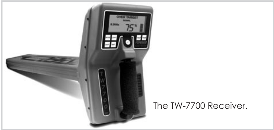
The TW-7700 Receiver.